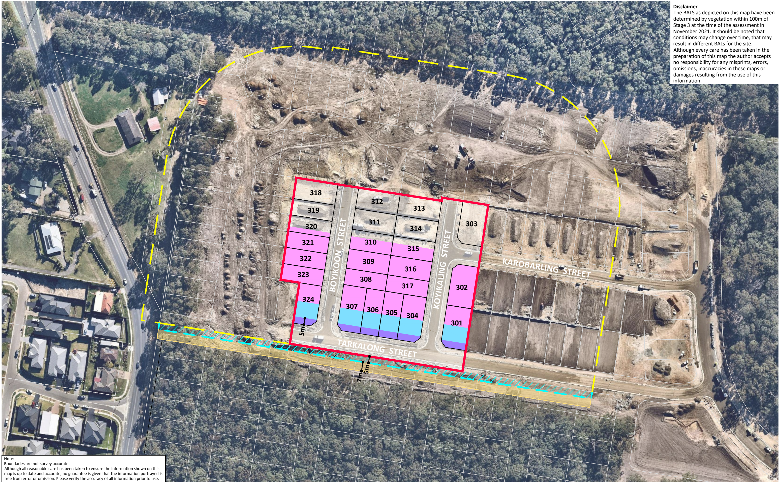
FIGURE 4-1: BUSHFIRE ATTACK LEVELS

CLIENT SITE DETAILS DATE Client Stage 3 Transfield Avenue Edgeworth 9 November 2021