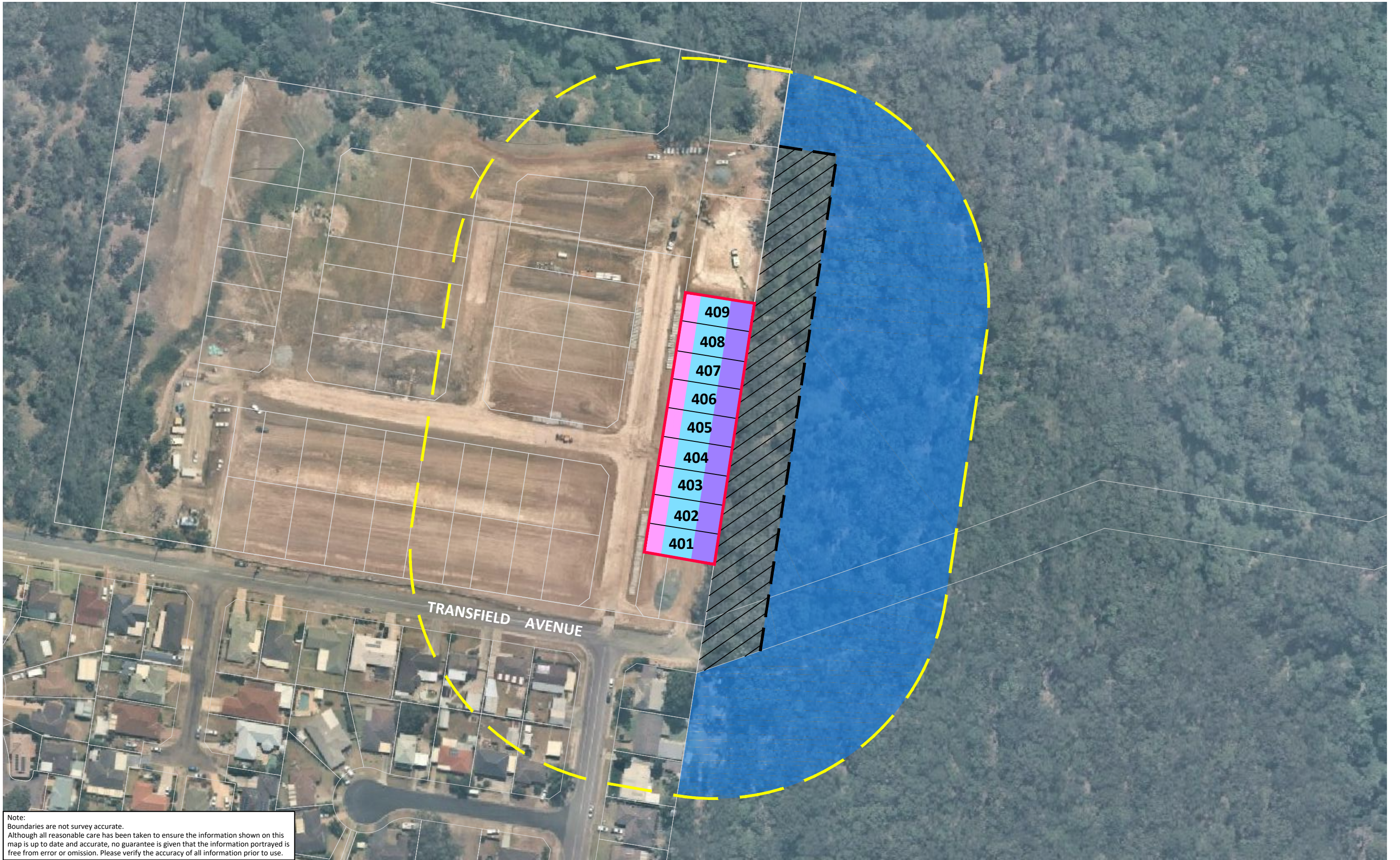
FIGURE 5-1: BUSHFIRE ATTACK LEVELS MAP

CLIENT SITE DETAILS DATE Client Stage 4 Transfield Avenue Edgeworth 14 May 2019